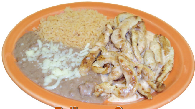
Pollo con Crema